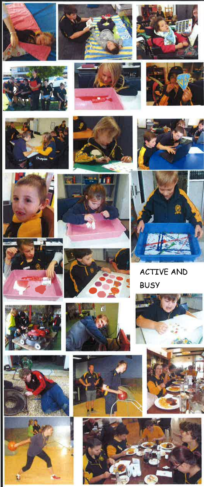
ACTIVE AND BUSY

Our Garage Sale still needs lots of donations. At this stage we will be holding it around the middle of term 3. Please send in donations which