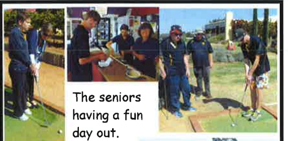
The seniors having a fun day out.